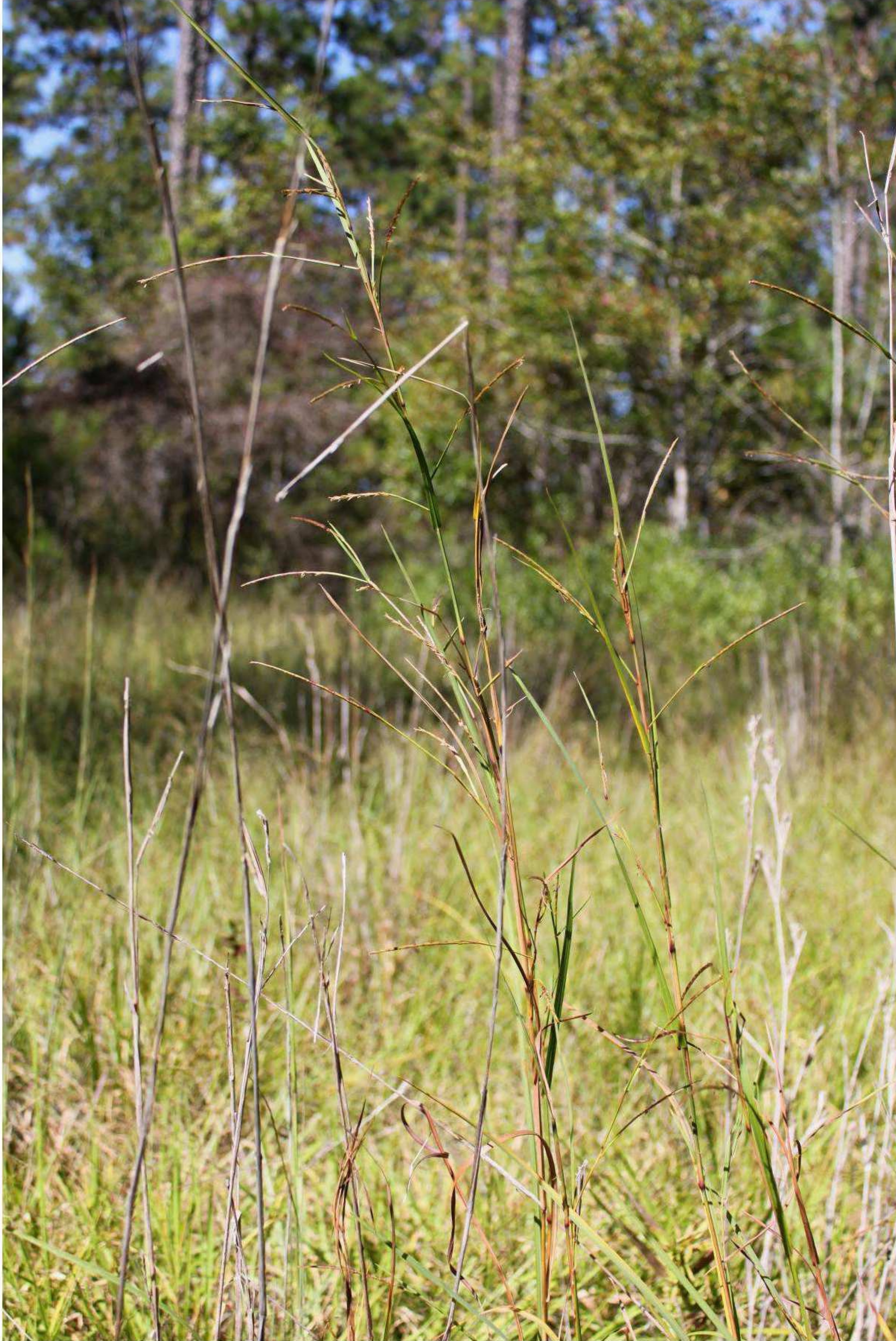
Figure 1. Coelorachis tuberculosa (Poaceae).